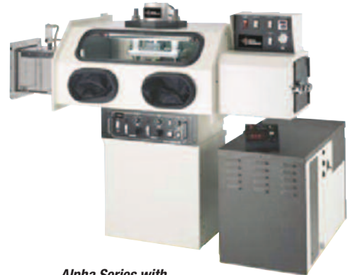
Alpha Series with Integrated Projection Welder