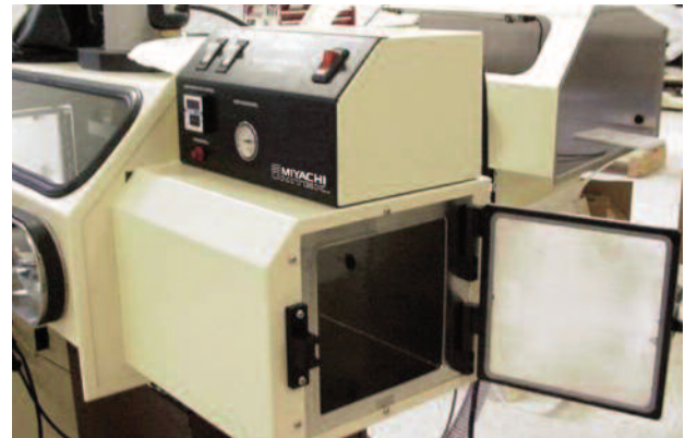
Alpha Series Optional Vacuum Bakeout Oven