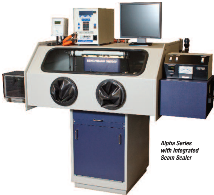
Alpha Series with Integrated Seam Sealer