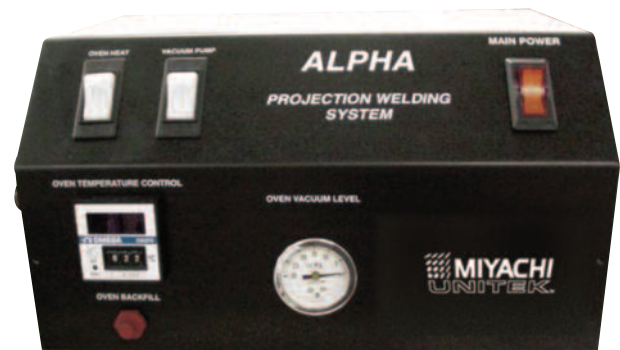
Vacuum Oven Controller Unit